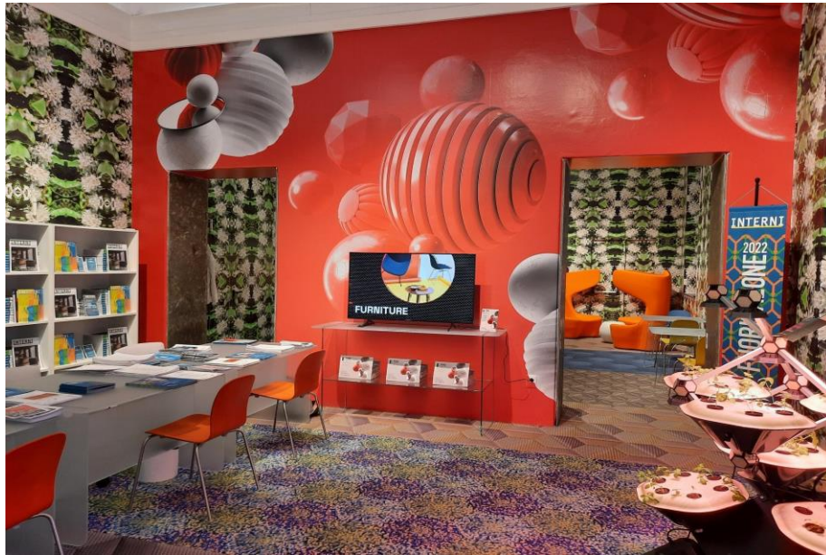
Press Room at Fuori Salone