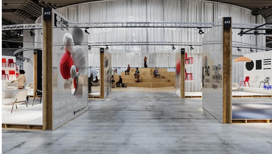
The Italian Design Future Capsule (Artist's Impression)

The layout of the space will consist of multiple sets, designed for the specific goods and categories, and will allow each brand to articulate its own identity and showcase products on vertical walls and on horizontal surfaces, both of which will be modular. This fluid and dynamic exhibition set-up will allow visitors to navigate freely inside a huge archive of creativity, excellence and savoir faire.