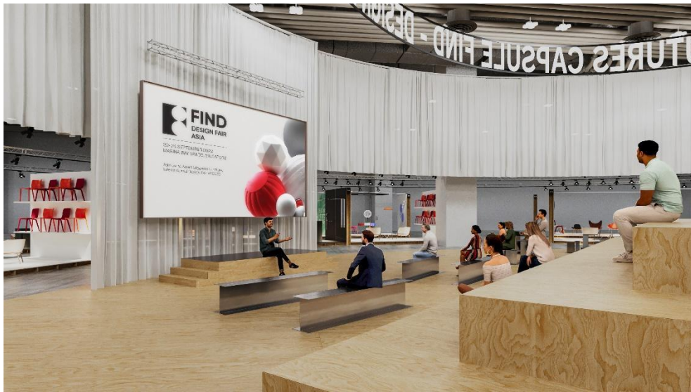
Avenue for the Sharing of Knowledge & Creativity (Artist's Impression)